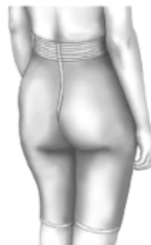
a snug pressure garment is worn after surgery around the lower part of the body to help reduce swelling

You are likely to need simple pain killers for a day or so after the operation and you will probably be asked to return a week after surgery to have sutures removed. A snug pressure garment or corset is usually advised around the lower part of the body. This is used to reduce bruising but can be taken off to wash, quickly dried and put back on. You can take this opportunity to bathe yourself. The corset is usually worn for two to three weeks.