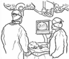
Endoscopic plastic surgery in progress

Sagging eyebrows can be lifted to a higher level. The procedure on its own can be carried out as a day case or with one night in hospital under general anaesthesia or local anaesthesia with intravenous sedation. There is usually swelling around the eyes after surgery which takes a few weeks to settle. Hair is sometimes lost around the scalp incisions and if this is the case it takes several months to re-grow.