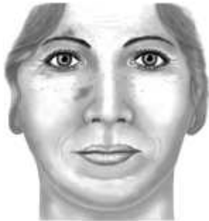
Typical wrinkles and pigment change due to sun damage.

No - they are different things. A facelift (rhytidectomy) lifts tissue and removes surplus skin. It is particularly good for the jaw and the neckline which is inaccessible to the laser. Excess skin is removed more precisely in an eyelid reduction (blepharoplasty) and the bags or bulging fat can be removed. The CO2 Laser will reduce fine wrinkles and tighten the skin of the lower eyelids generally rather than precisely.