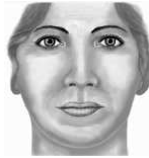
The laser can be directed to treat specific areas or more commonly the whole face excluding the neck.